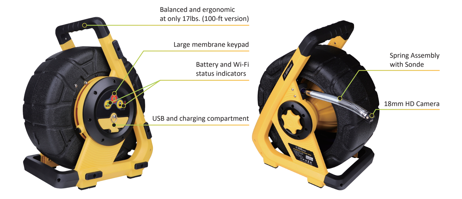
Instantly share files or entire projects

Backed by Vivax-Metrotech's superior dealer network, customer service and service centers.