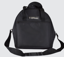
Reel Carry Bag