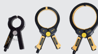
2", 4", and 5" Induction Clamps