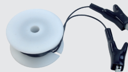
Ground Extension Spool