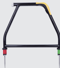
VM-510FFL+ Fault Locator