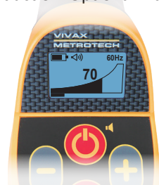
Peak locate response with accompanying audio tone

One induction, three direct connect and a fault find frequency