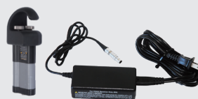
VM series Li-ion Rechargeable Transmitter Battery Kit