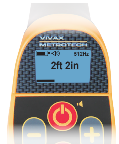
Push button depth reading